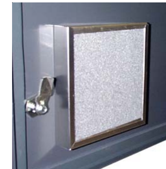
Optional Filter Vent Kits