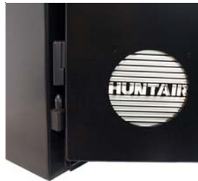
Removable Door Assembly (Shown with Optional Logo)