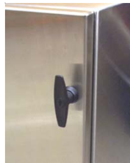
Optional Door Latches Shown