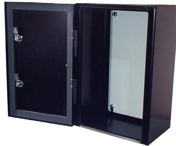
Adjustable Depth Back-Pan