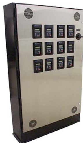
Optional Stainless Steel Construction