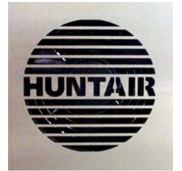
Custom Laser Cut Logos are Available