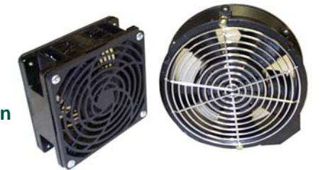
Enclosure Ventilation Fan