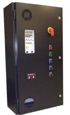
Custom Wired Enclosure Packages Available