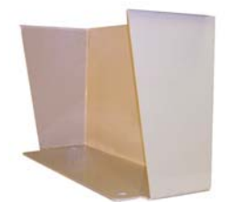
Floor Stands (From 6" to 24 High)