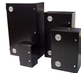
NEMA - 4 Enclosures